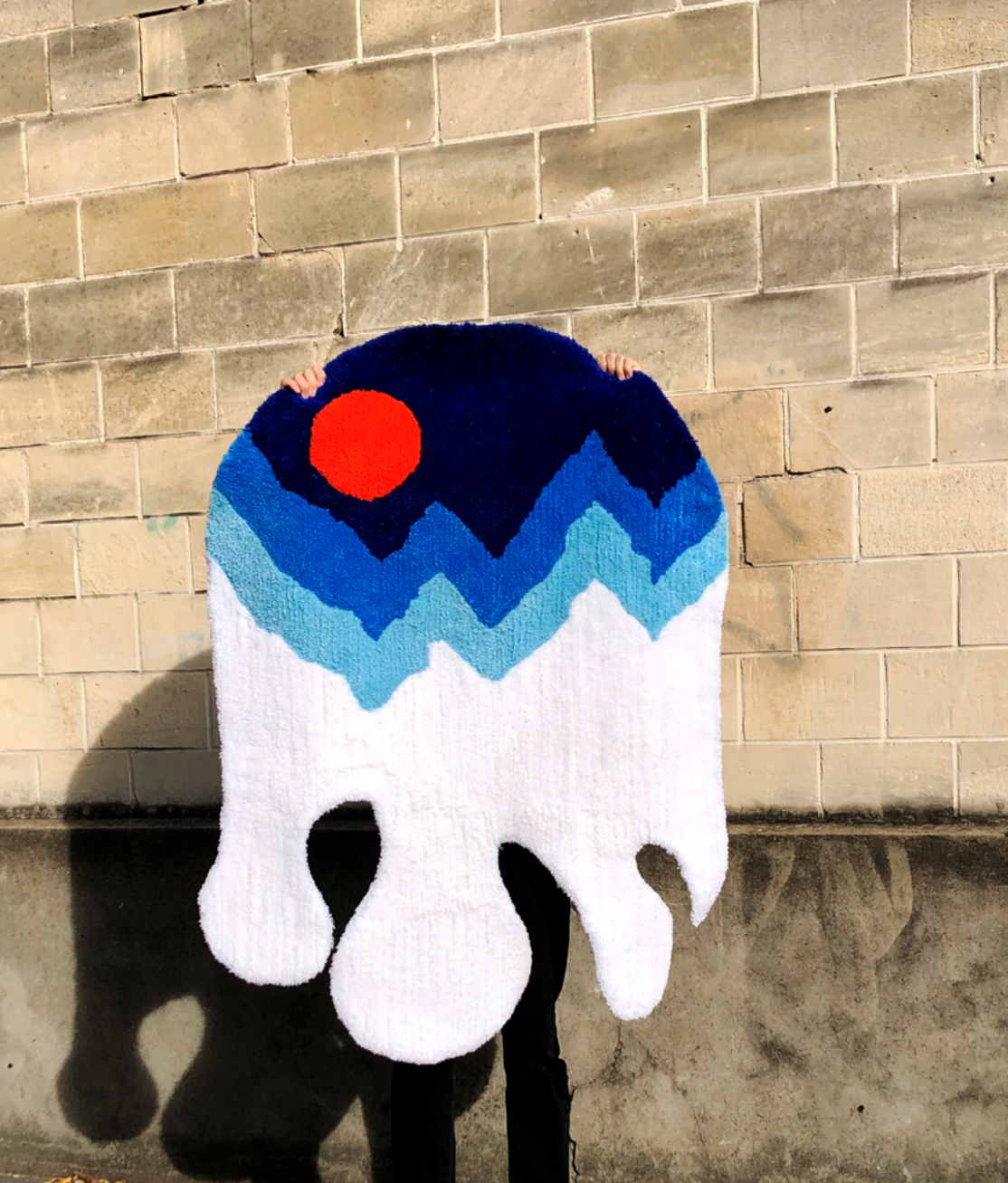
Left: As the sun slips over my shoulder, 2023 Tufted rug for the performance, inspired by a road pannel in Mentone. Right : White Horse (This ain't Hollywood, this is a small town) A rug featuring the composition of orange labels and images taken in Mentone.