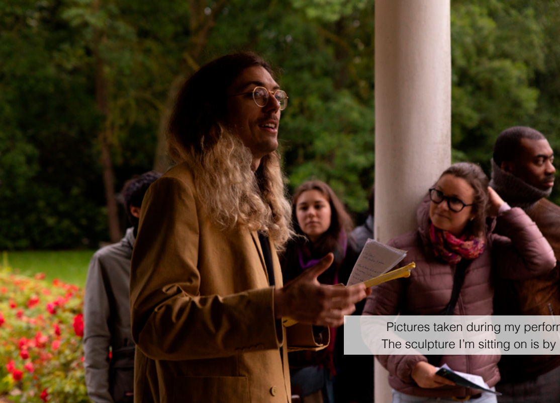
Pictures taken during my performance at Villa Savoye, June 2024. The sculpture I'm sitting on is by Louise Margot Decombas.