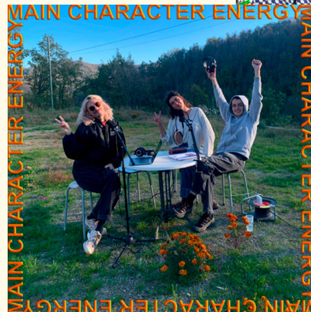
Episode 1 with Eugénie Zély, artist and writer