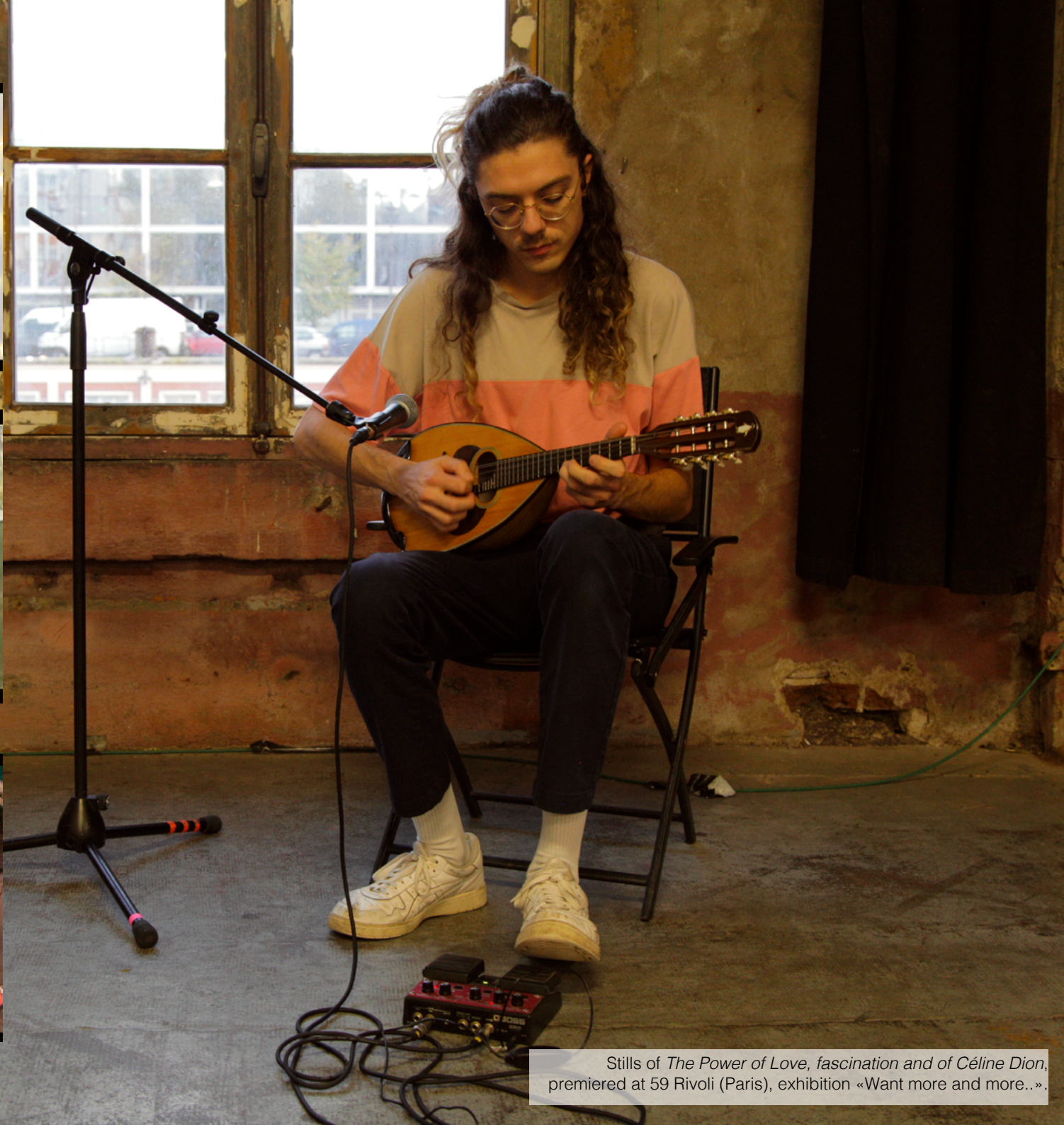
Stills of The Power of Love , fascination and of Céline Dion, premiered at 59 Rivoli (Paris), exhibition «Want more and more...».