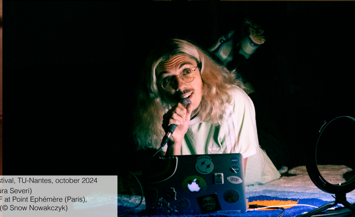
Left : During the Fauves festival, TU-Nantes, october 2024 Right :Duringl JERK OFF at Point Ephémère (Paris), september 2024