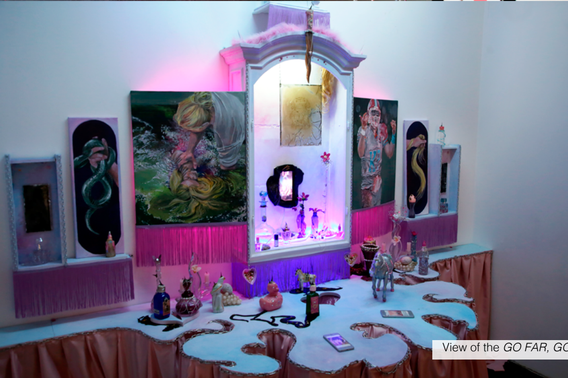
View of the GO FAR, GO HARD exhibition, Glassbox, 2021