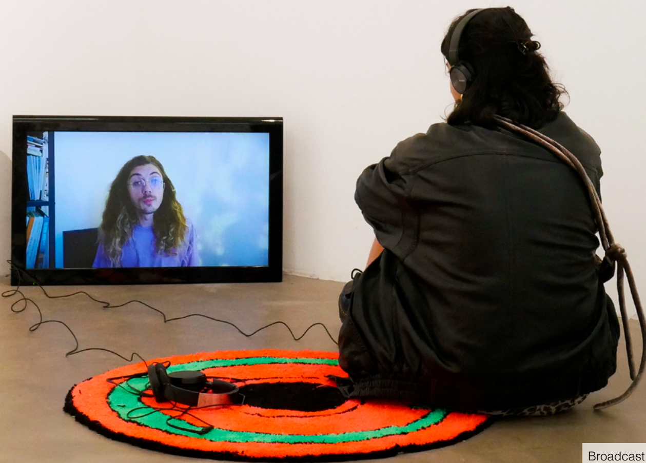
Broadcast setup for the exhibition am i a nepo baby? by Théo Diers Vidéo : Le pouvoir de l'amour, de la fascination et de Céline Dion , 2023 Rug : I Heard It All Before (rug) , 2024