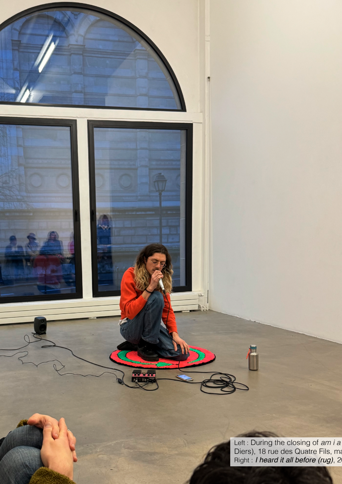
Left : During the closing of am i a nepo baby? (curation :Théo Diers), 18 rue des Quatre Fils, march 2024. Right : I heard it all before (rug) , 2024, tufted rug.